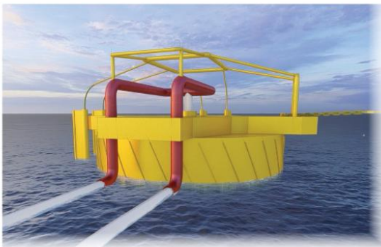
Rendering of an offshore single point mooring buoy for crude export.