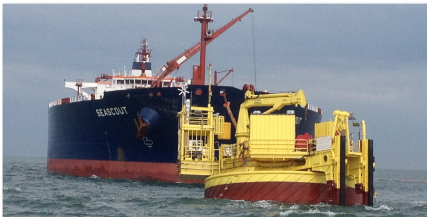
Phillips 66 Tetney Monobuoy, Humber Estuary, UK